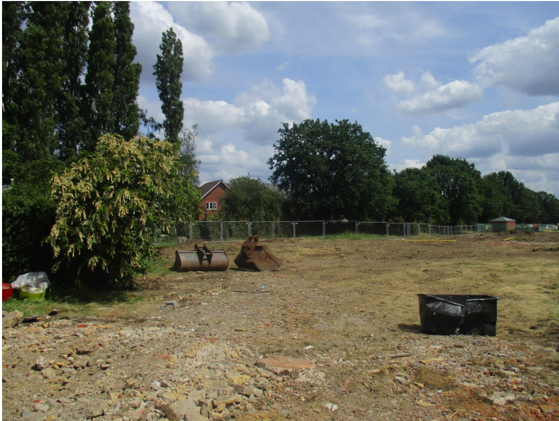
Approved development (land south of 24-46 Kings Road and 6 & 9 Rose Meadow)